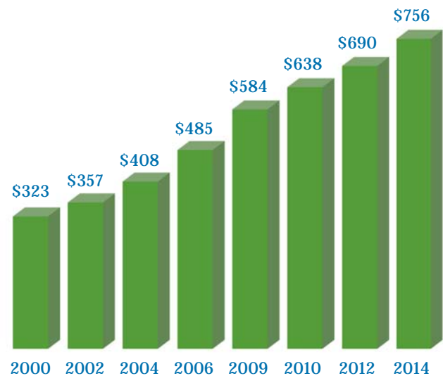
Annual Average Cost of Sewer Service

Ten percent use less than 100% of metered water usage to determine the sewer bill, with values ranging from 60% to 95%.